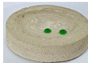
0,5% MXP5 addition